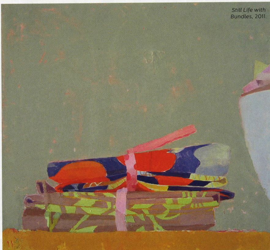
Still Life with Bundles, 2011.